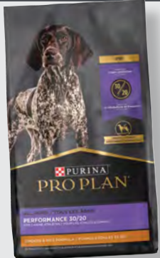
Purina Pro Plan SPORT Performance 30/20 Chicken & Rice