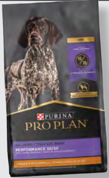
Purina Pro Plan SPORT Performance 30/20 Chicken & Rice