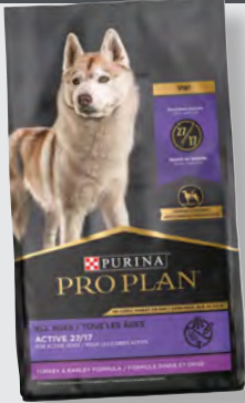
Purina Pro Plan SPORT Active 27/17 Turkey & Barley