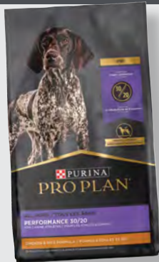
Purina Pro Plan SPORT Performance 30/20 Chicken & Rice

Her cookie-cutter Whippets are revered for their proper balance and movement, correct bone, smooth, flowing lines, pretty heads, small, rose ears that fold along the neck, and soft, pleasing expressions. “People have told me over the years that my dogs are like clones,” she says. “I am very proud that they are identifiable as Karasar Whippets.”