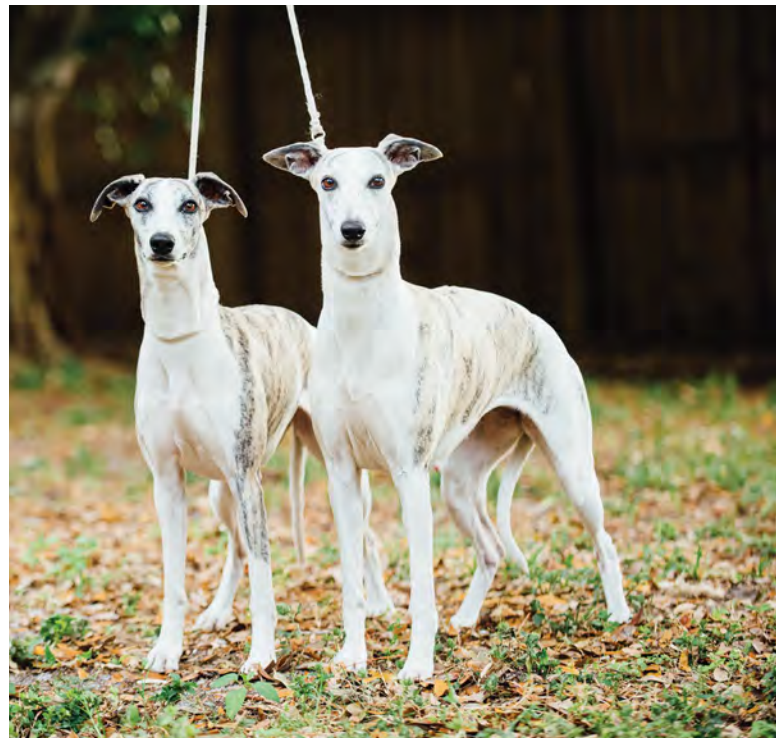
Mother-daughter look-alikes are GCHB Karasar’s High Roller, left, 2 years old, and MBIS GCHG Karasar’s Iconic, 7 years old, the No. 1 Whippet in all-breed in 2018.

in Show Whippets,” she says. “Sixteen dogs have won Best in Show or Reserve Best in Show.”