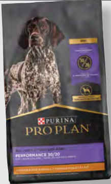
Purina Pro Plan SPORT Performance 30/20 Chicken & Rice