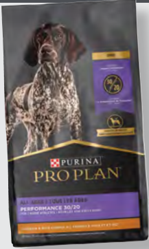
Purina Pro Plan SPORT Performance 30/20 Chicken & Rice